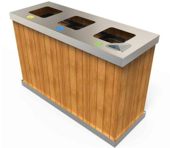
Image of external communal areas waste segregation recycling system

Image of internal communal space waste segregation recycling system