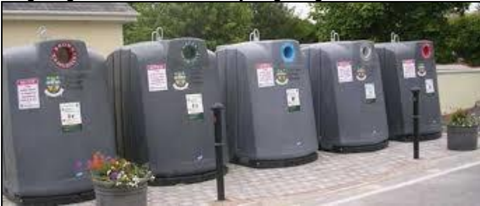
Image of glass and aluminium recycling bring bank