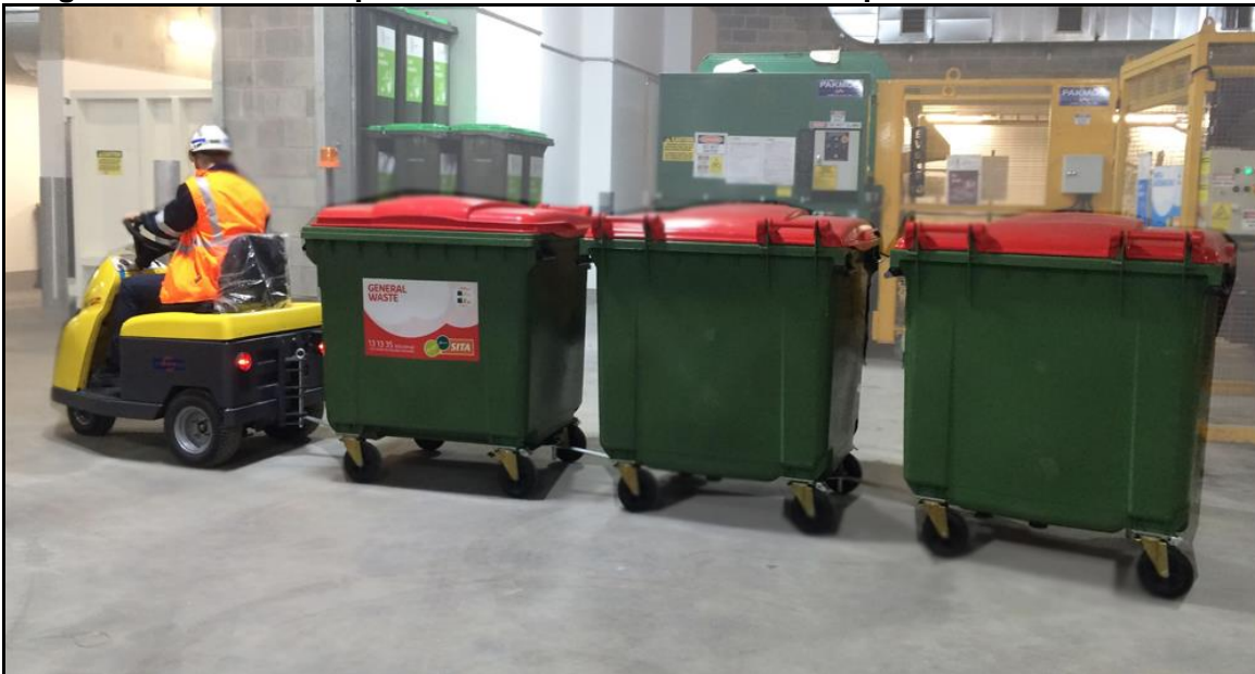
Image of Bulk bin transport from bin stores to collection point

Appendix I presents the site plan showing the proposed bin storage areas and the associated bin collection points.