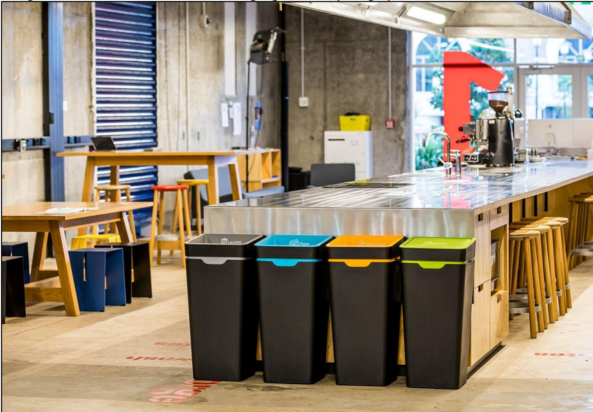
Image of communal kitchen waste segregation recycling system

Waste generated at the communal kitchen shall be managed by the facilities management company who shall provide waste segregation bin systems for grey (mixed waste), green (dry recyclable), brown (organic) and cardboard / plastic / paper packaging waste. It is calculated that up to 700kg of waste would be generated per week at the communal kitchens.